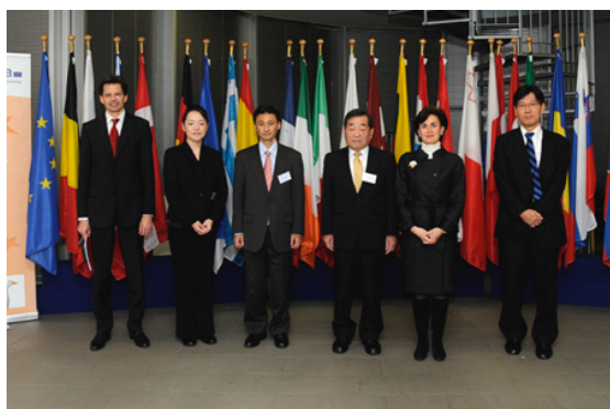
Signing with EFSA (December 2009 at Parma)

FSC has built cooperative relationship with EFSA and FSANZ via exchanging latest knowledge and inviting experts in past years, and these relationships will be further strengthened by signed MOC and corresponding periodical meetings. Other regions/countries are also treated as a partner of food safety as well, and these relationships will be likewise continued.